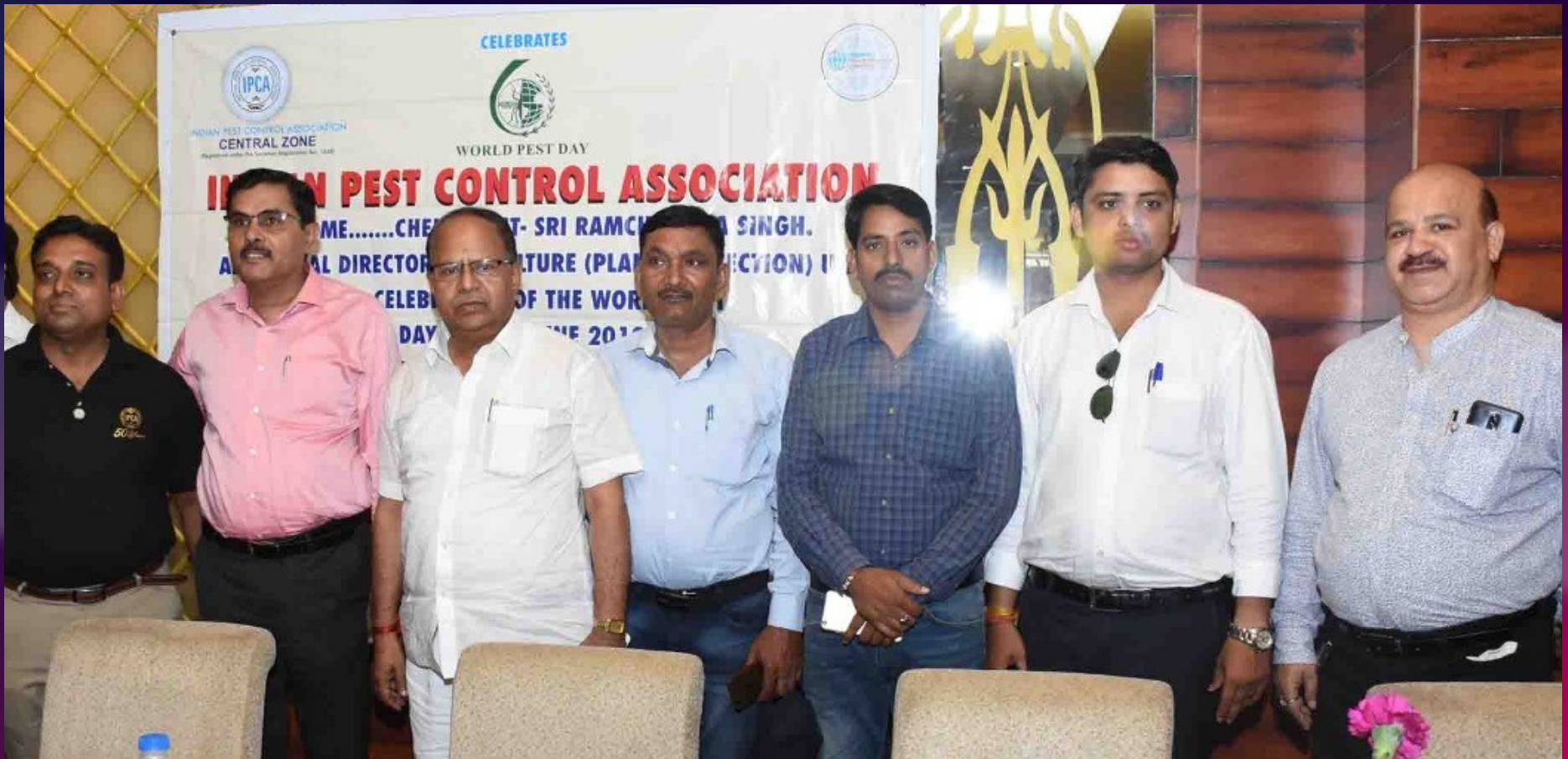
World Pest Day IPCA, Lucknow