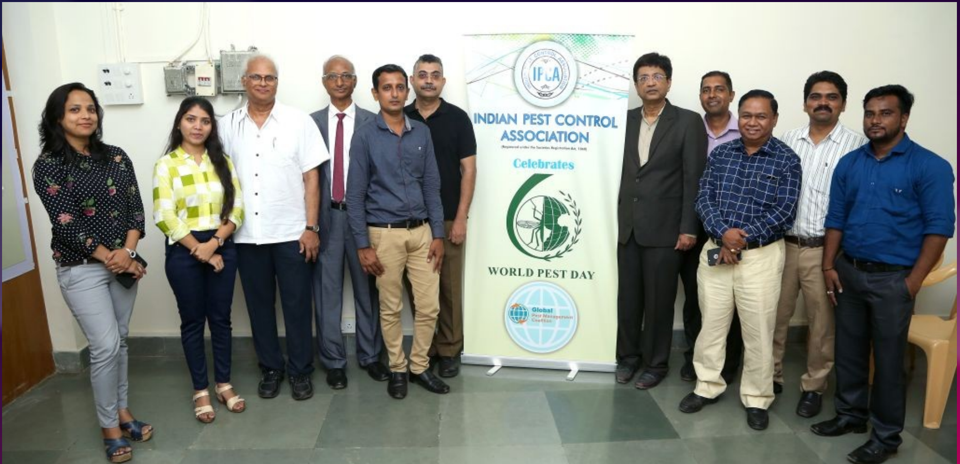
World Pest Day IPCA, Mumbai