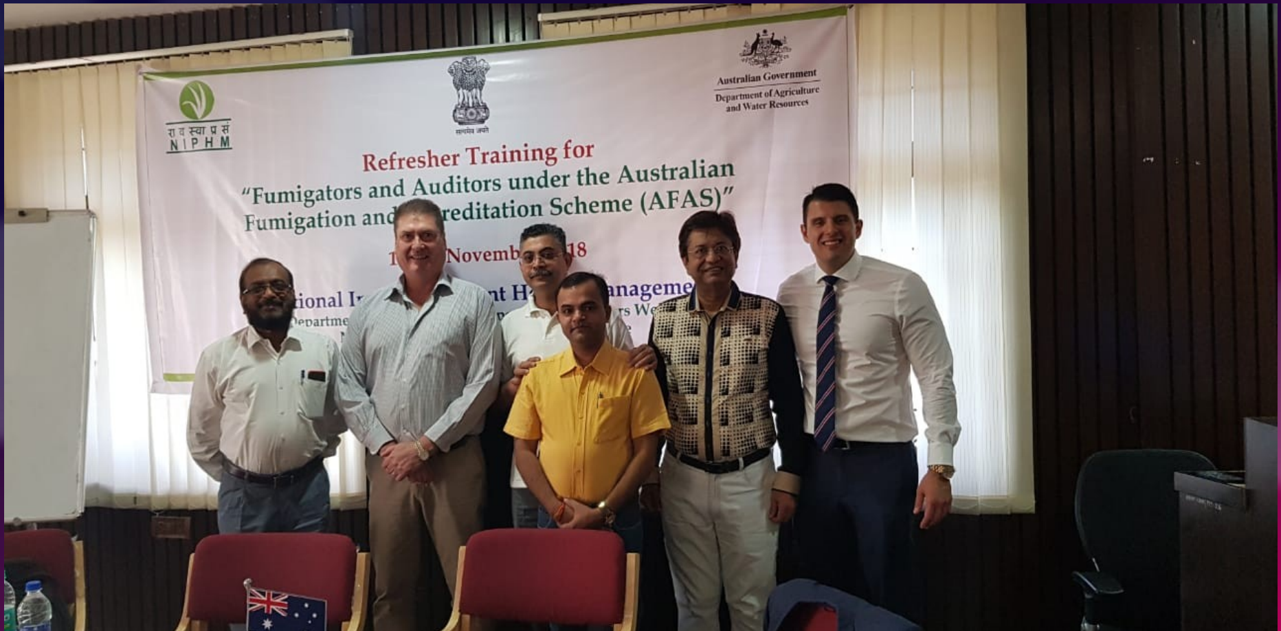
AFAS Refresher Training NIPHM, Hyderabad