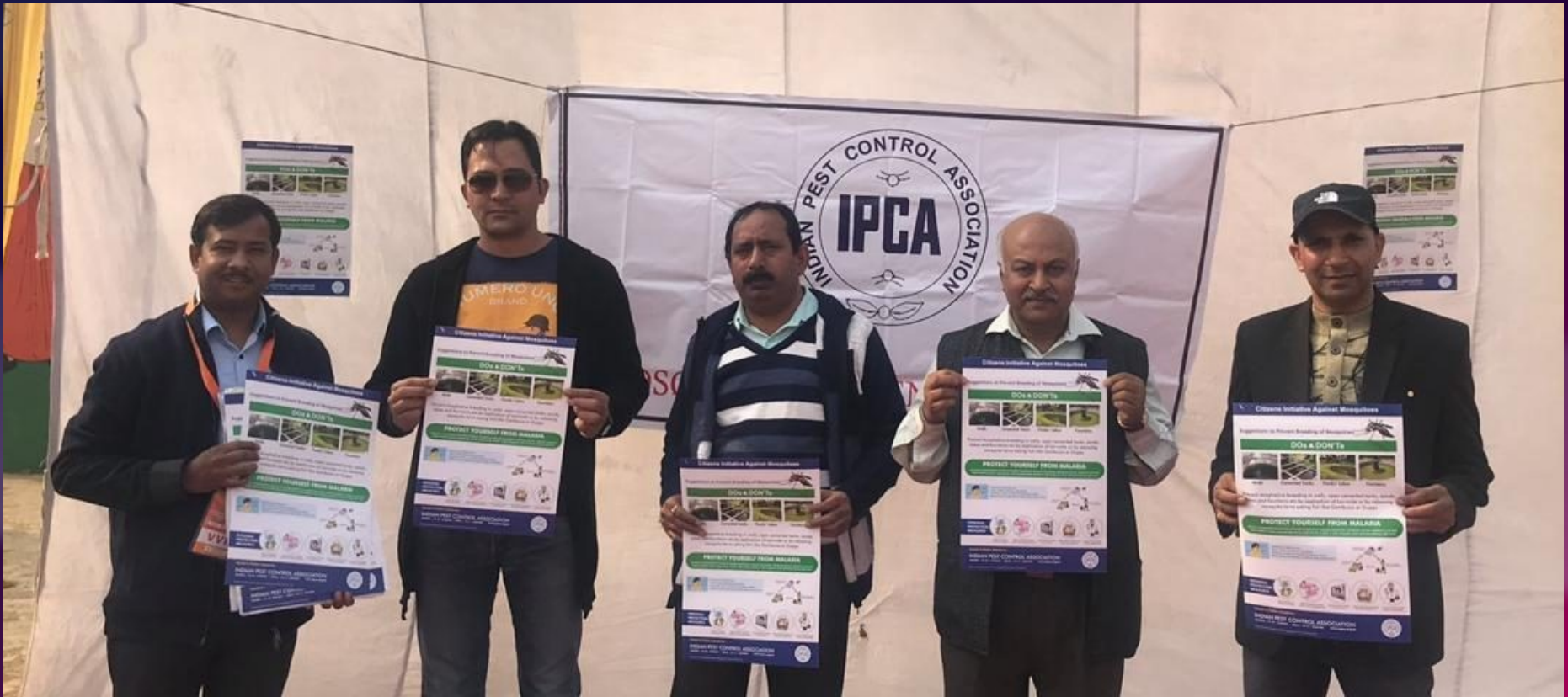
Mahakothish Fair Ghaziabad, U.P.